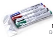
(SETFIXWB) MARKER PENS BOARDMARKER