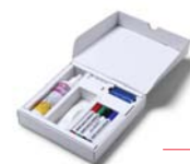
(STARTERKIT) STARTERKIT STARTPACKUNG